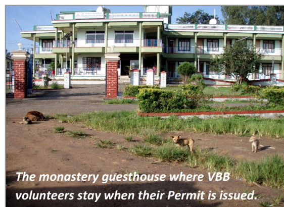
The monastery guesthouse where VBB volunteers stay when their Permit is issued.