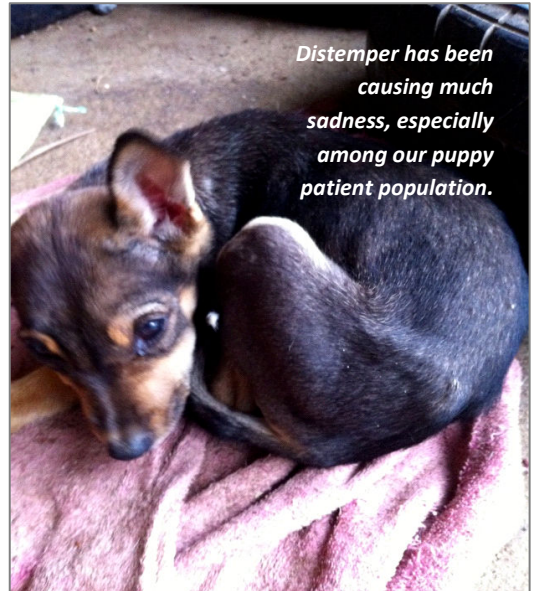
Distemper has been causing much sadness, especially among our puppy patient population.

A few cases have survived only to suffer neurological deficits. Sometimes they eventually die of the neurologic problems secondary to the infection. But now we've been to Mysore (three hours away) and bought vaccines, there is hope that we can stop this disease and protect our local dogs.